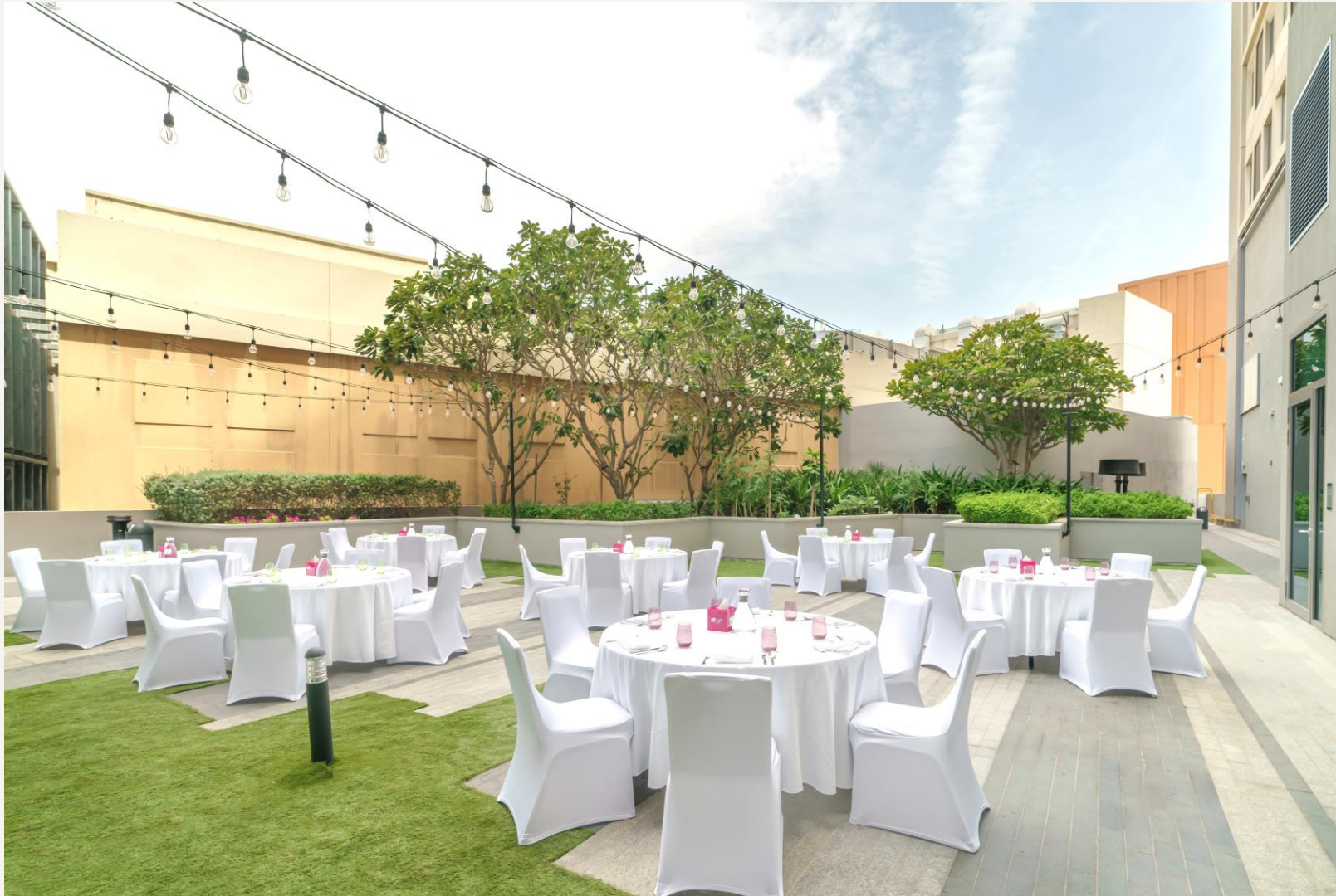
Aloft Dubai Creek